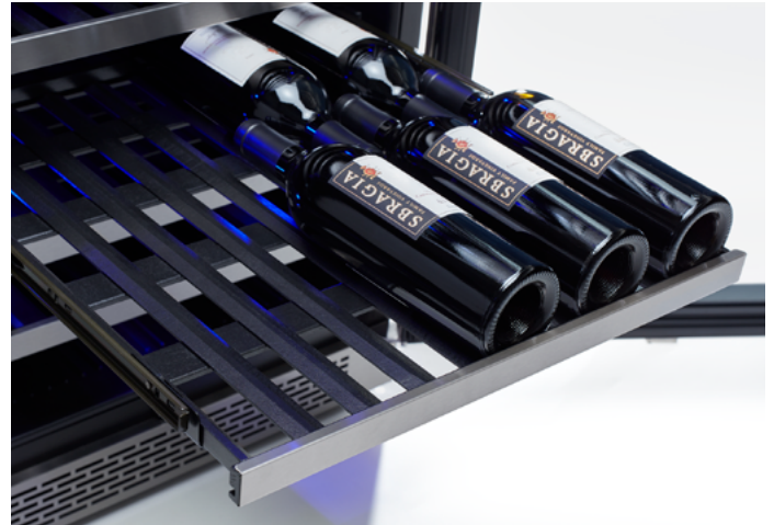
Full-Extension Wood Racks